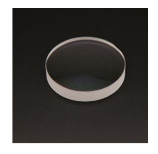
25 - 45 €

Lens cover, will protect your lens against scratches. Ask for your diameter. (ilustration image)